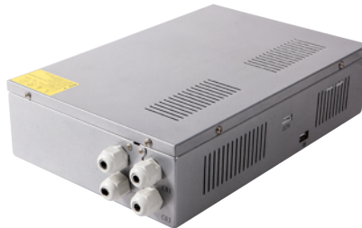
③ EG6000C Loop controller 35x23x9cm