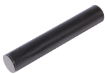
① Floor transponder ø15x3cm