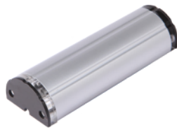
② Side transponder 12x4x3cm